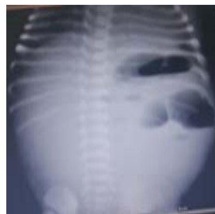
Figure 2: Neonatal X-ray Abdomen plain

A 32-year-old healthy primigravida with a normal pregnancy was scheduled for her 34th-week obstetric evaluation. The ultrasound showed a single fetus in cephalic presentation, with a normal weight for gestational age and with dilatation of gut loop. The amniotic fluid index was normal, and no other fetal anatomic anomalies were observed.