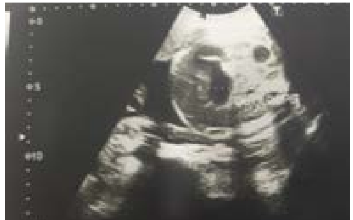
Figure 1: Fetal ultrasound