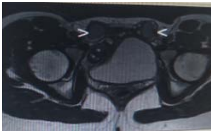
Figure 1: MRI Pelvis